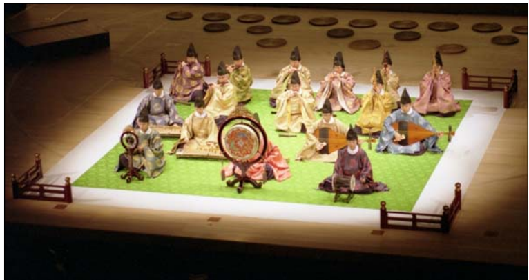
Reigakusha Gagaku Group.