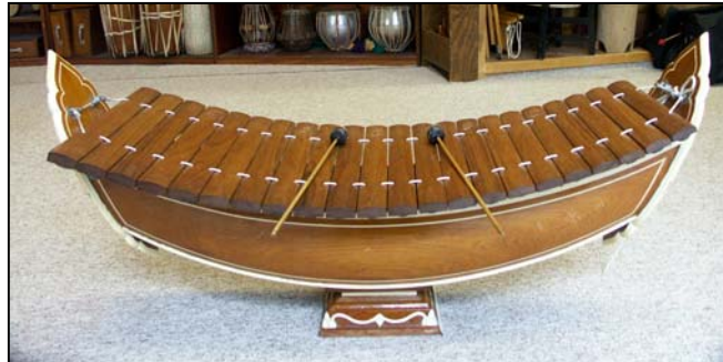
The Ranāt ēk

1. How does the ranāt ēk player sustain notes?