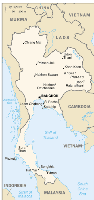
Map of Thailand